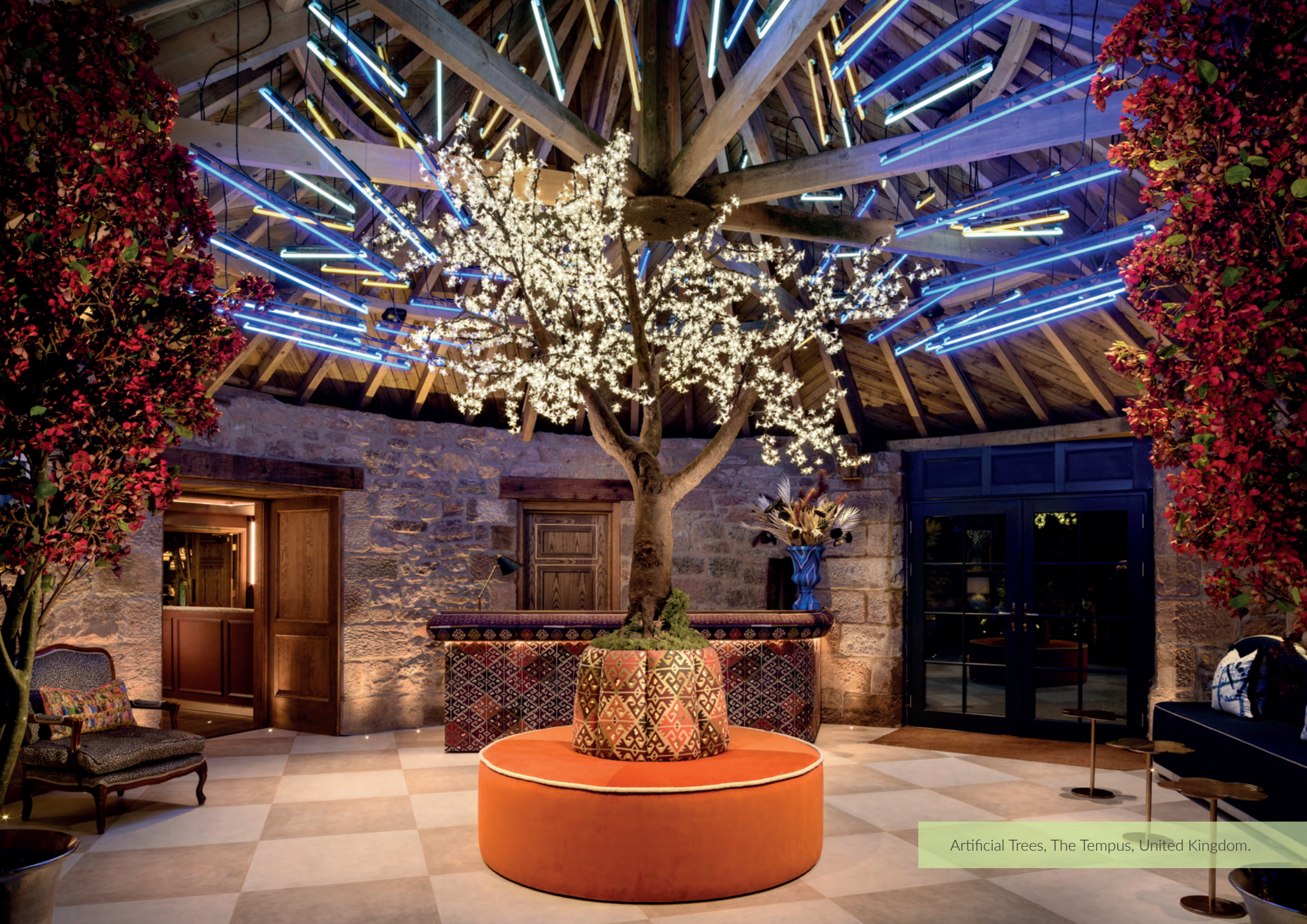
Artificial Trees, The Tempus, United Kingdom.