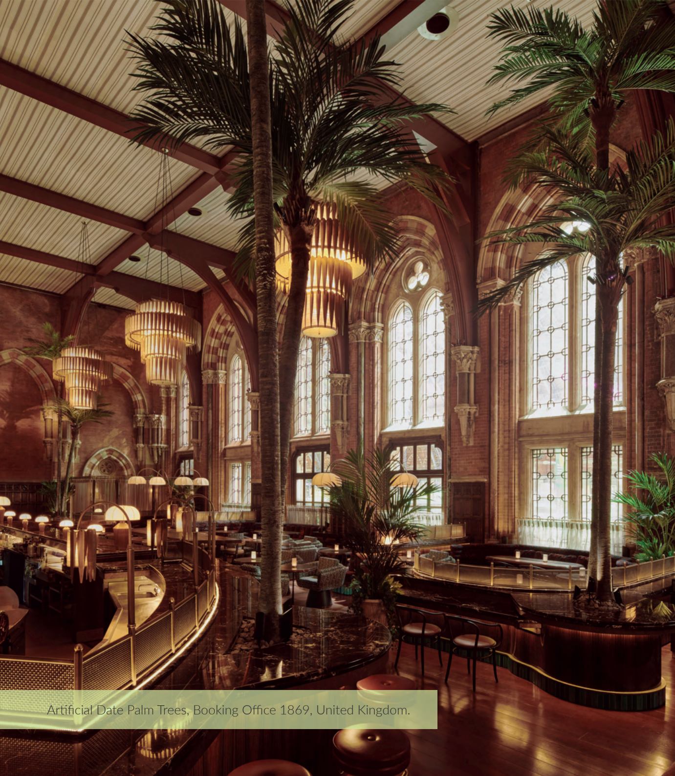
Artificial Date Palm Trees, Booking Office 1869, United Kingdom.