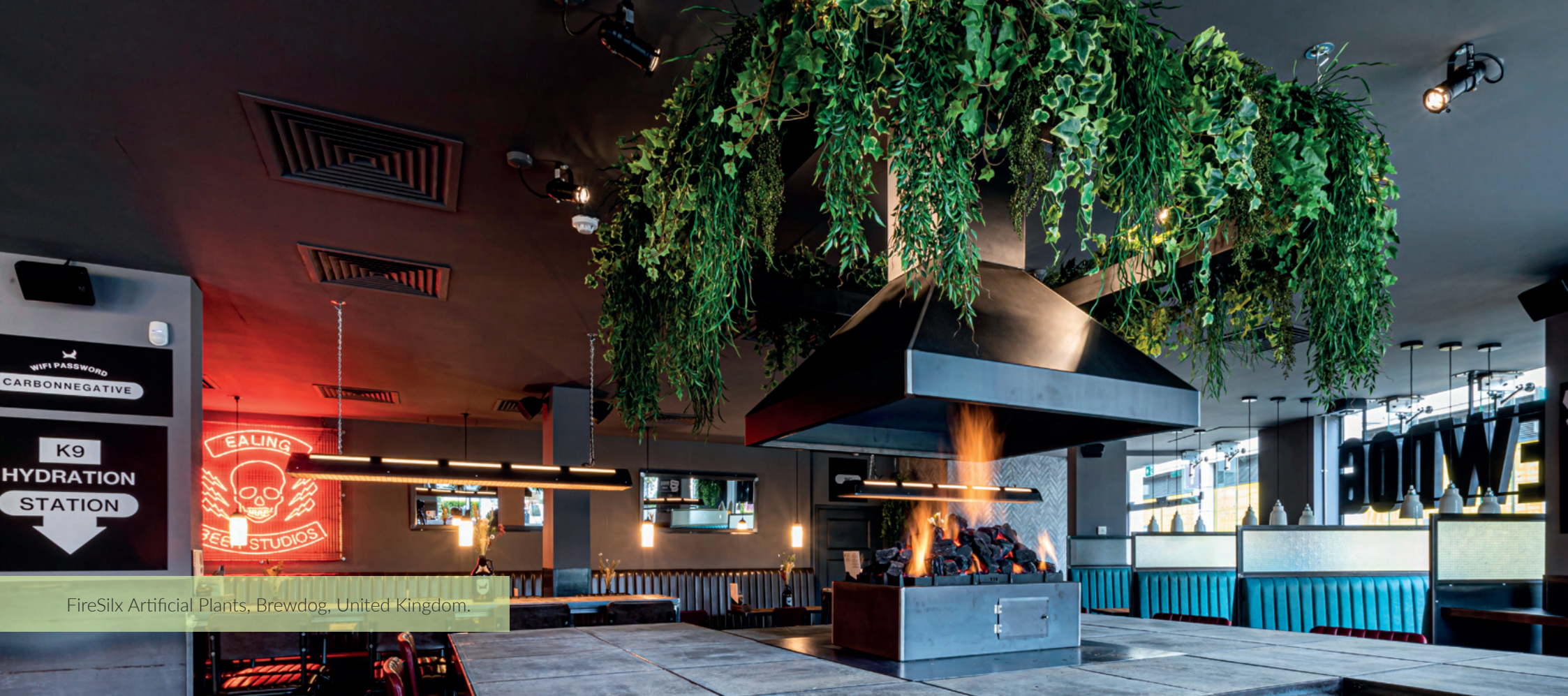
FireSilx Artificial Plants, Brewdog, United Kingdom.