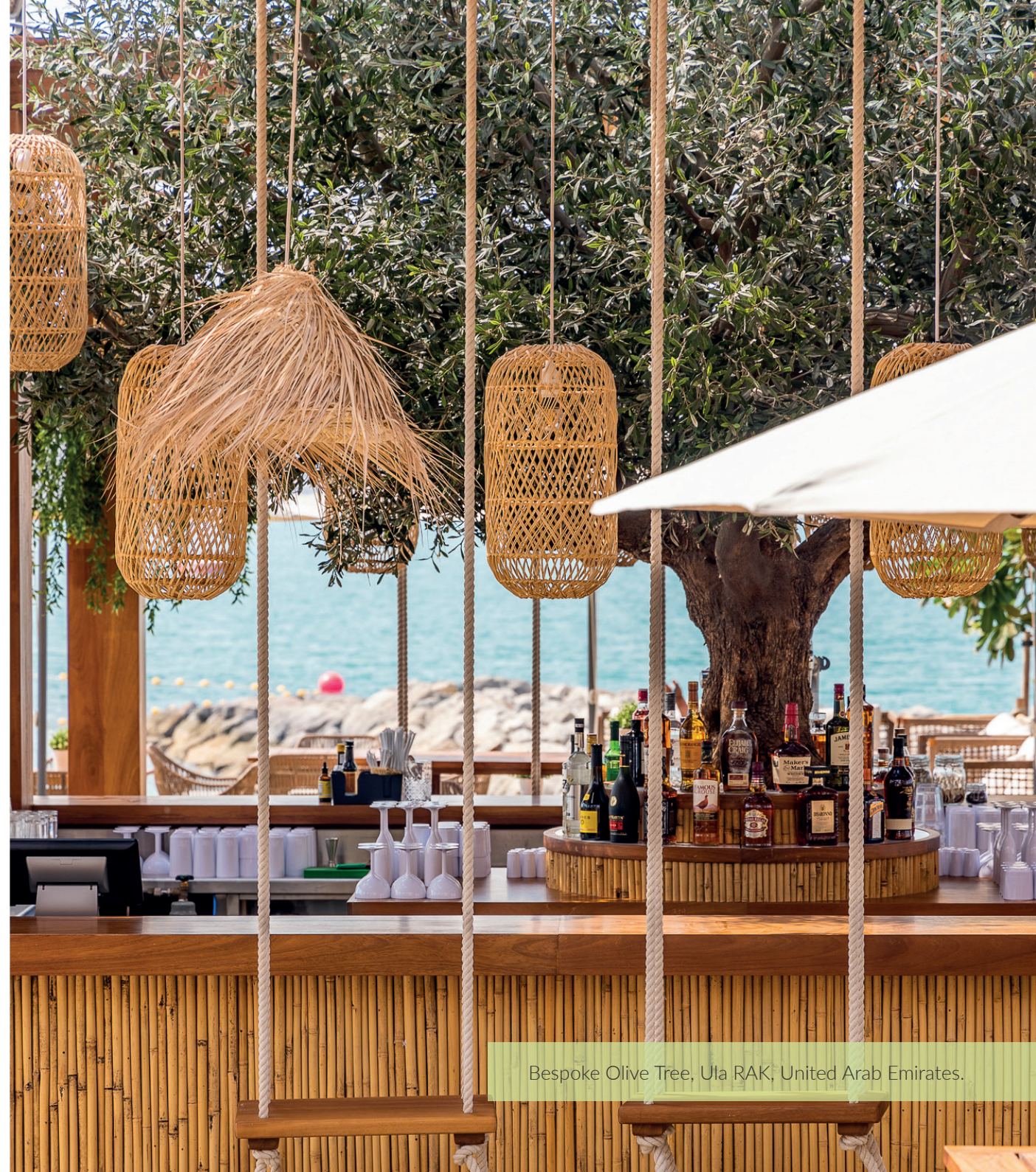
Bespoke Olive Tree, Ula RAK, United Arab Emirates.

The result is a tree preserved for generations, honouring and retaining all the natural characteristics it was born with.