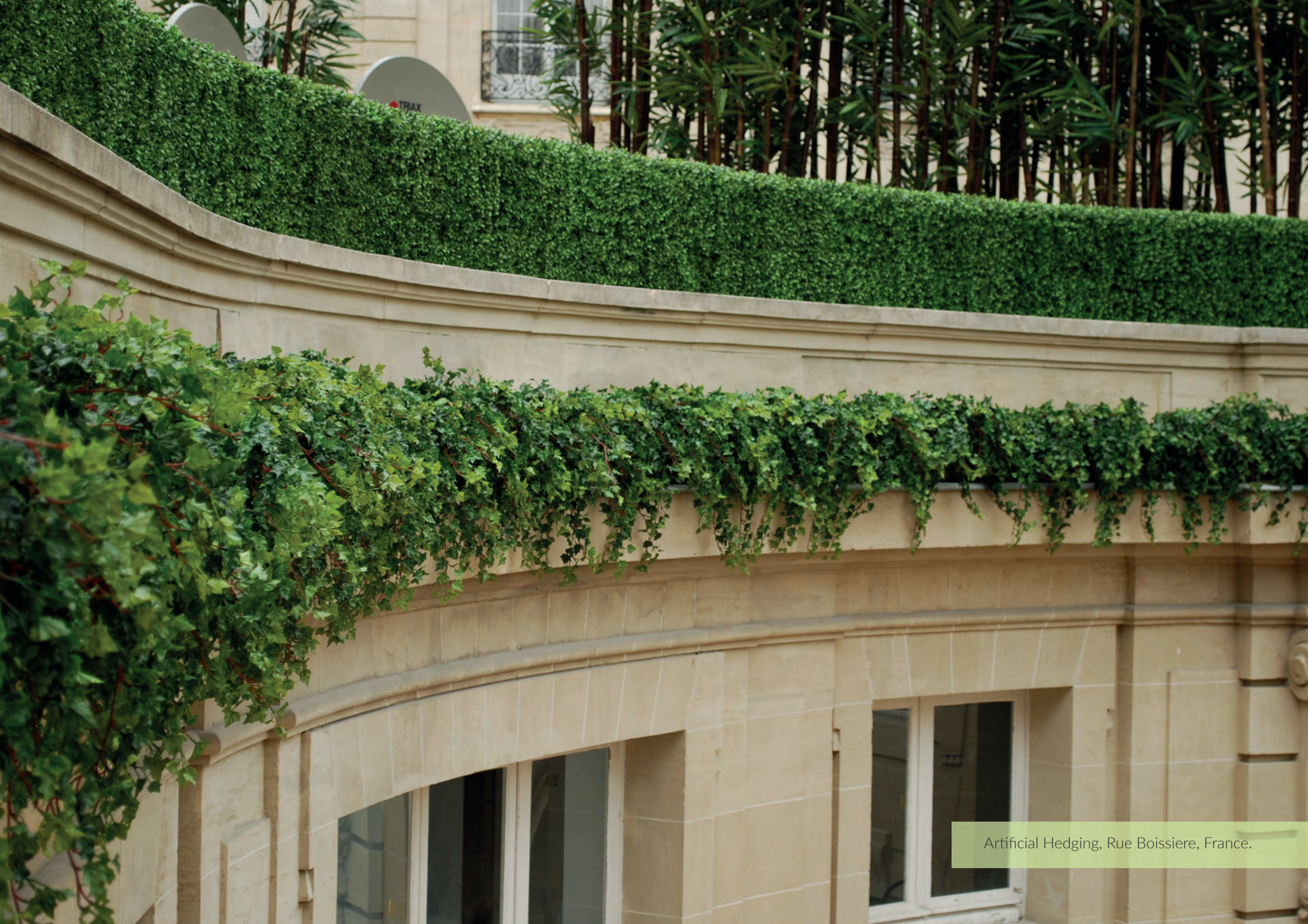
Artificial Hedging, Rue Boissiere, France.