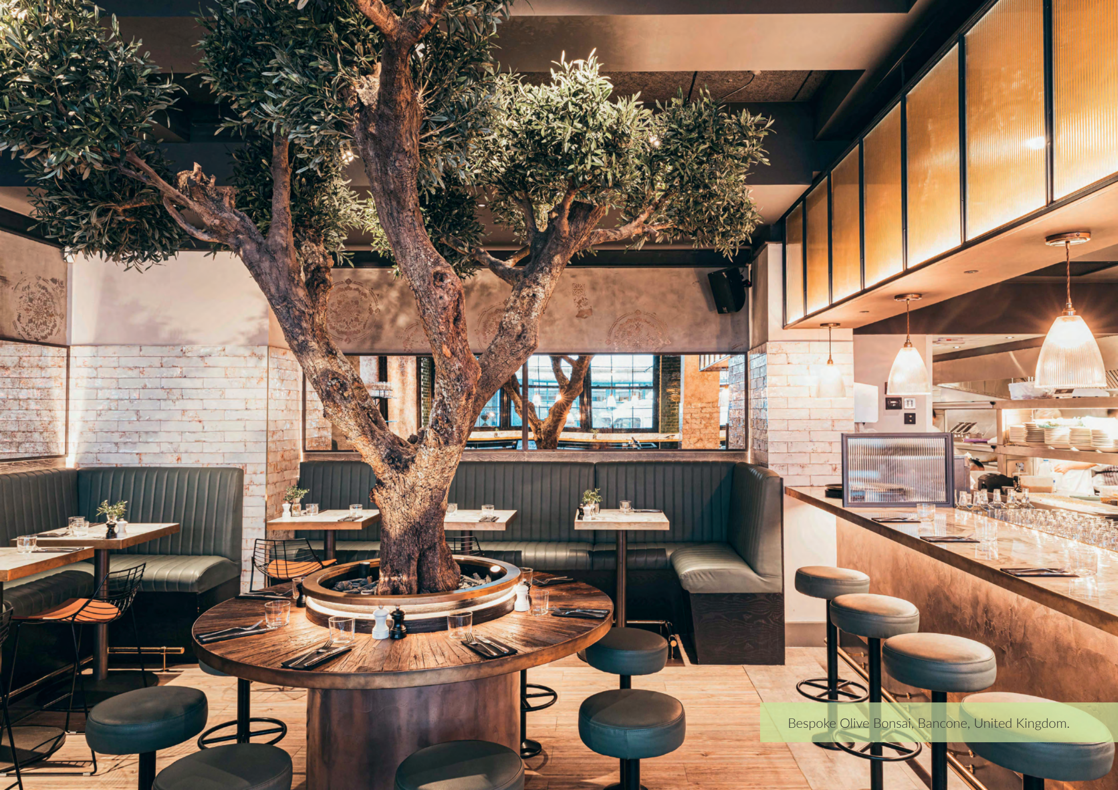
Bespoke Olive Bonsai, Bancone, United Kingdom.