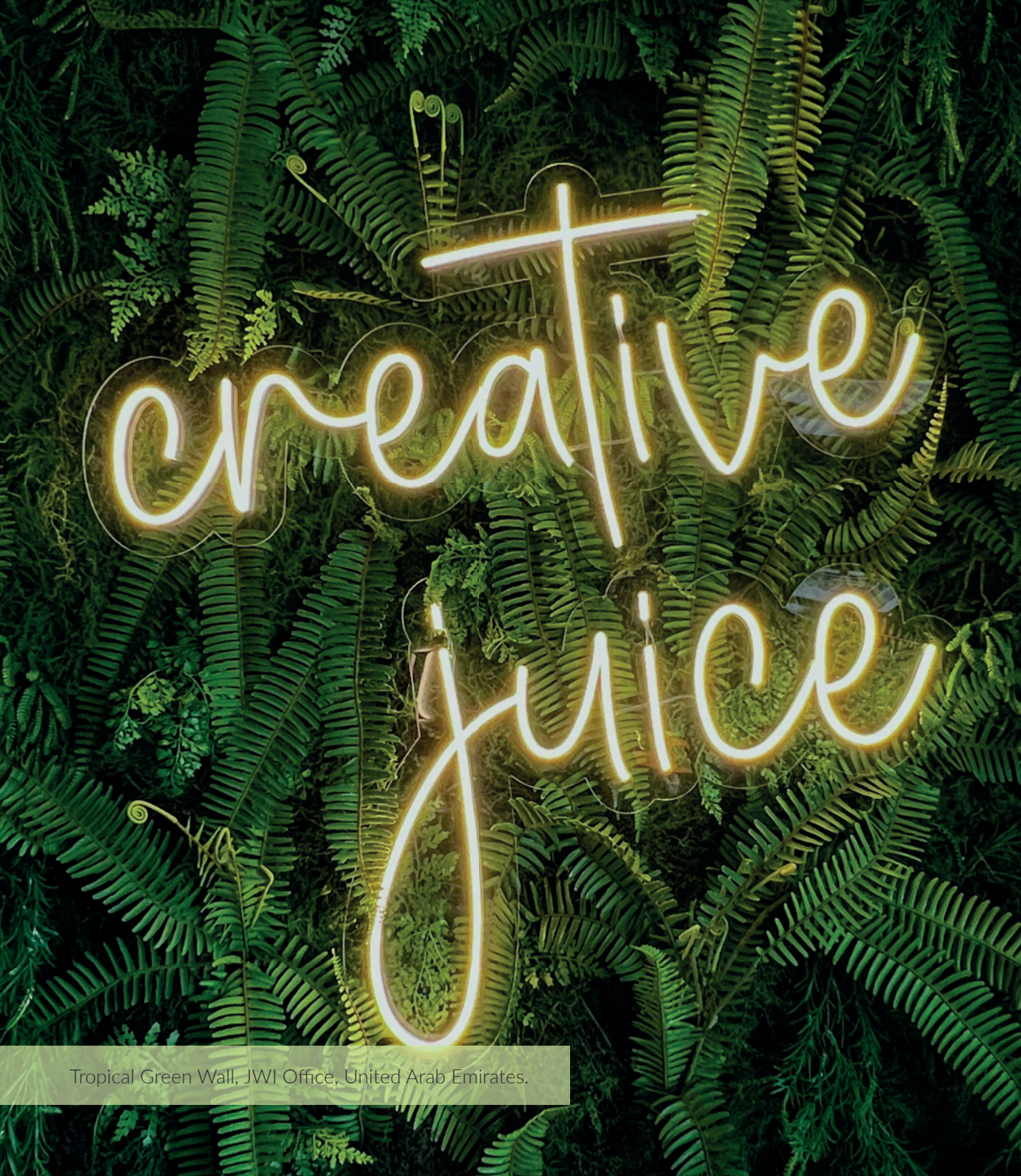
Tropical Green Wall, JWI Office, United Arab Emirates.