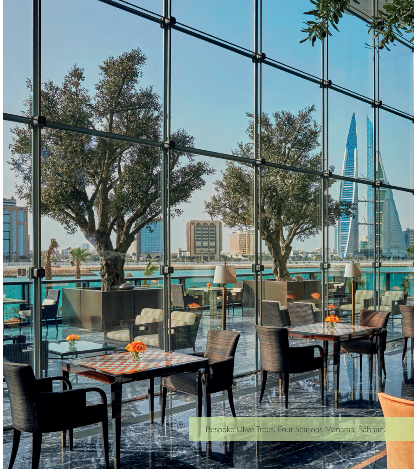
Bespoke Olive Trees, Four Seasons Manama, Bahrain.

UVSilx is inherently UV-resistant, with the UV inhibitor integrated during the manufacturing process. This inherent resistance makes UVSilx products significantly more resilient against fading compared to sprayed alternatives. UVSilx products are tested to ISO 489-3 and ATSM G154-12a, with official certification available upon request.