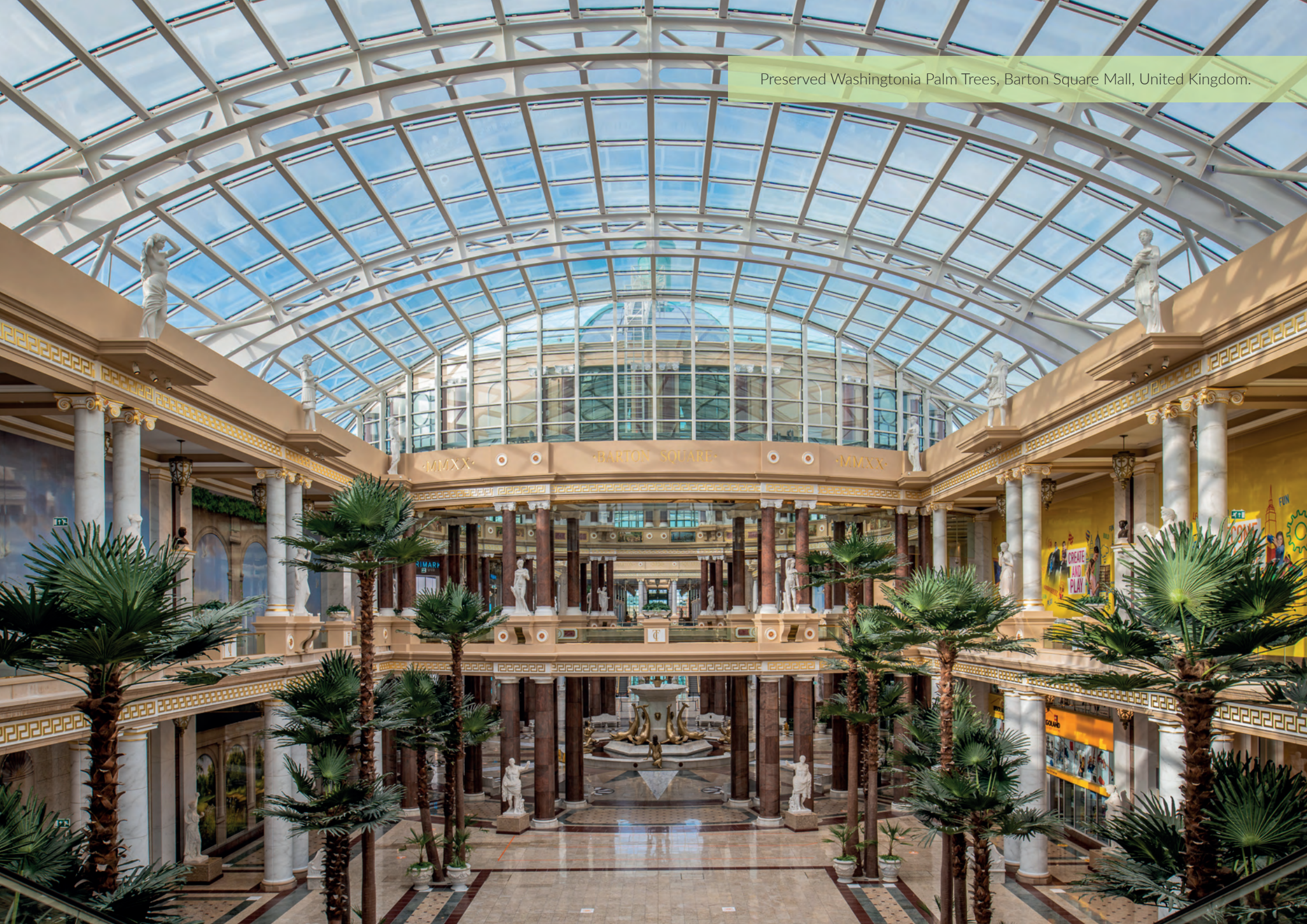
Preserved Washingtonia Palm Trees, Barton Square Mall, United Kingdom.