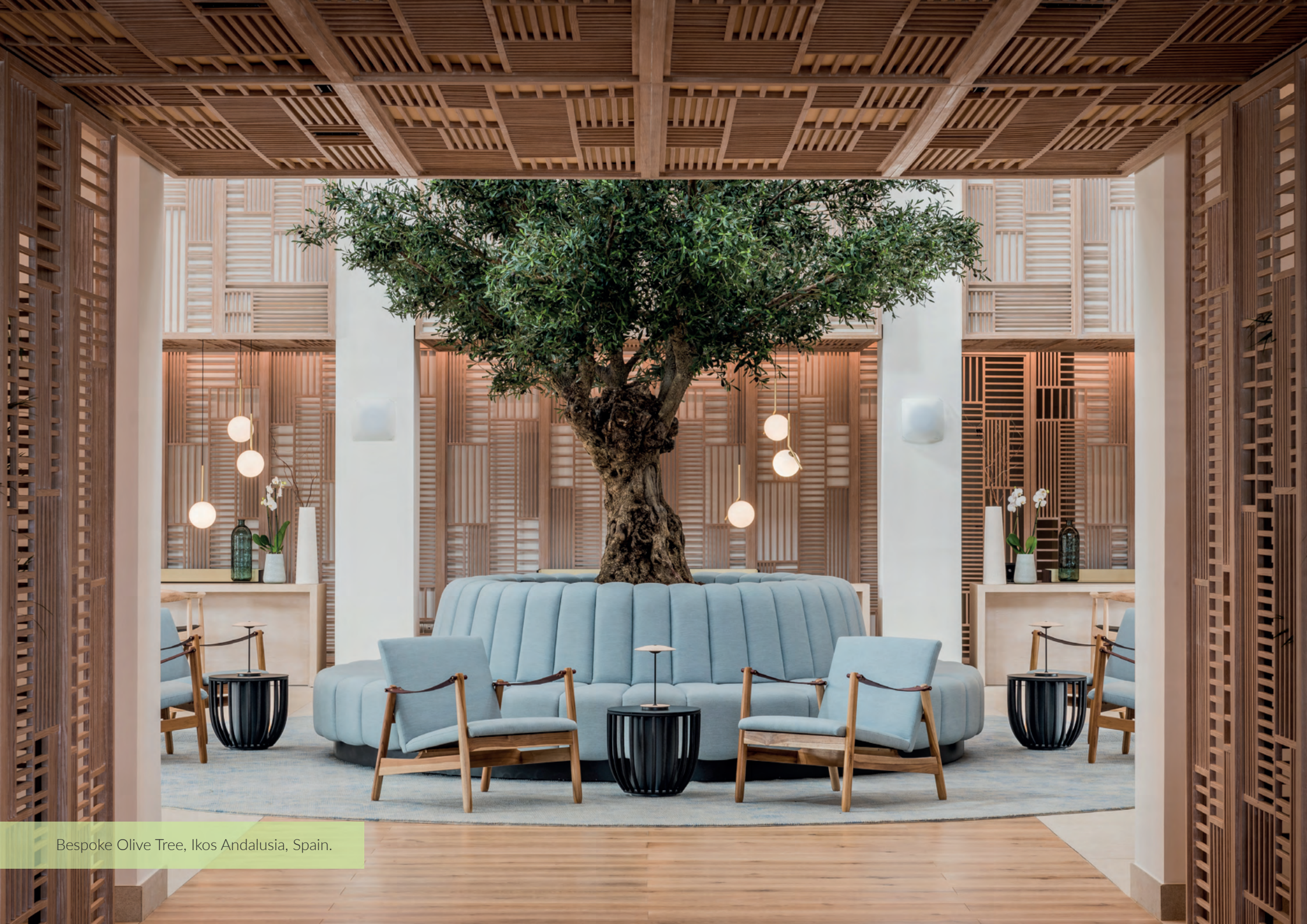
Bespoke Olive Tree, Ikos Andalusia, Spain.