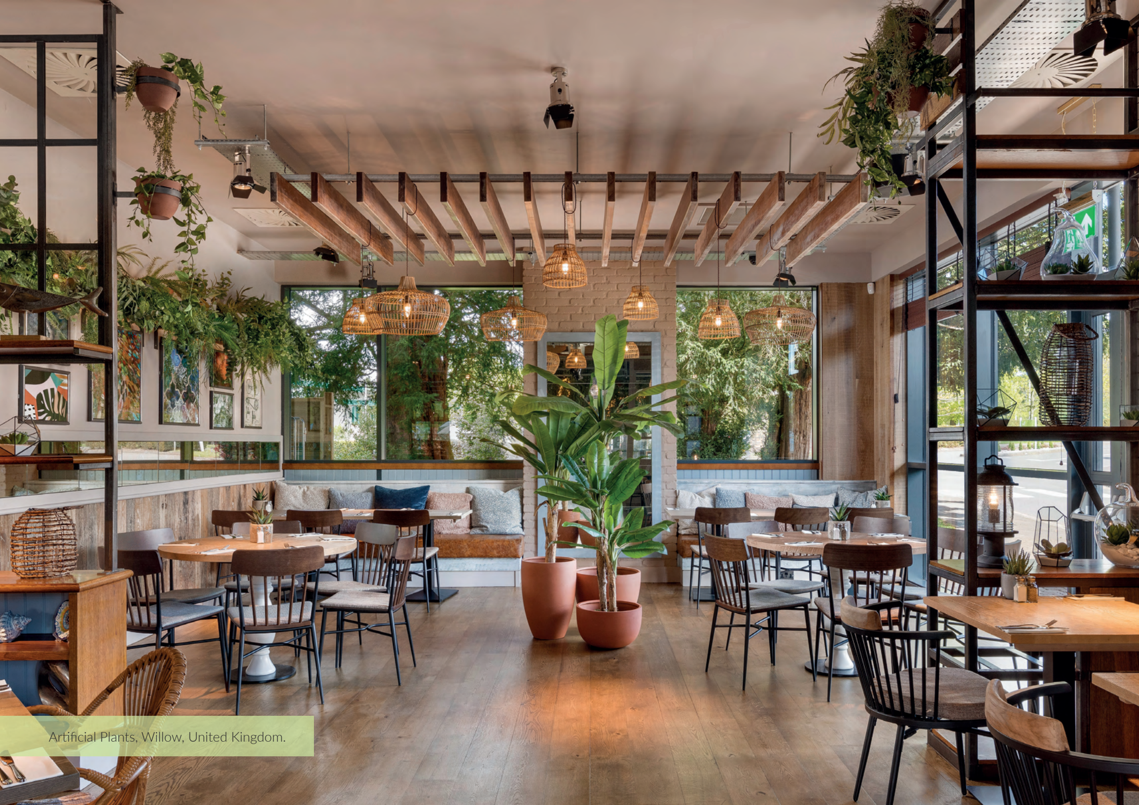
Artificial Plants, Willow, United Kingdom.