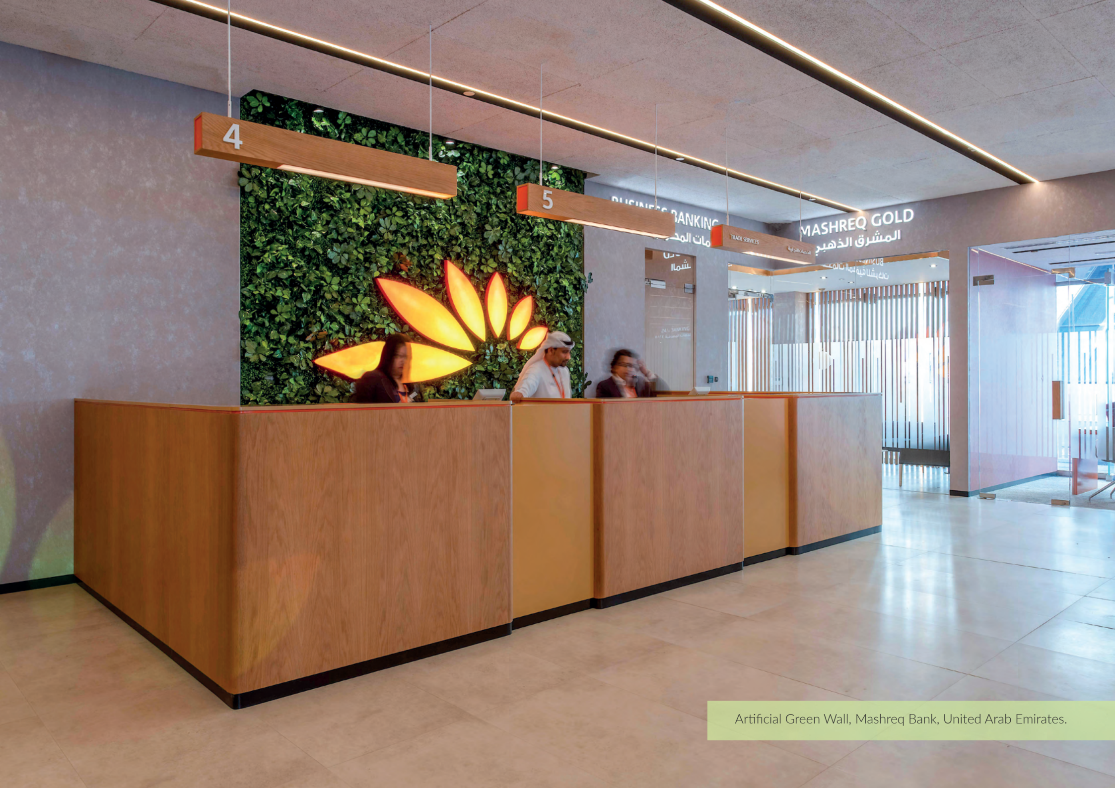
Artificial Green Wall, Mashreq Bank, United Arab Emirates.