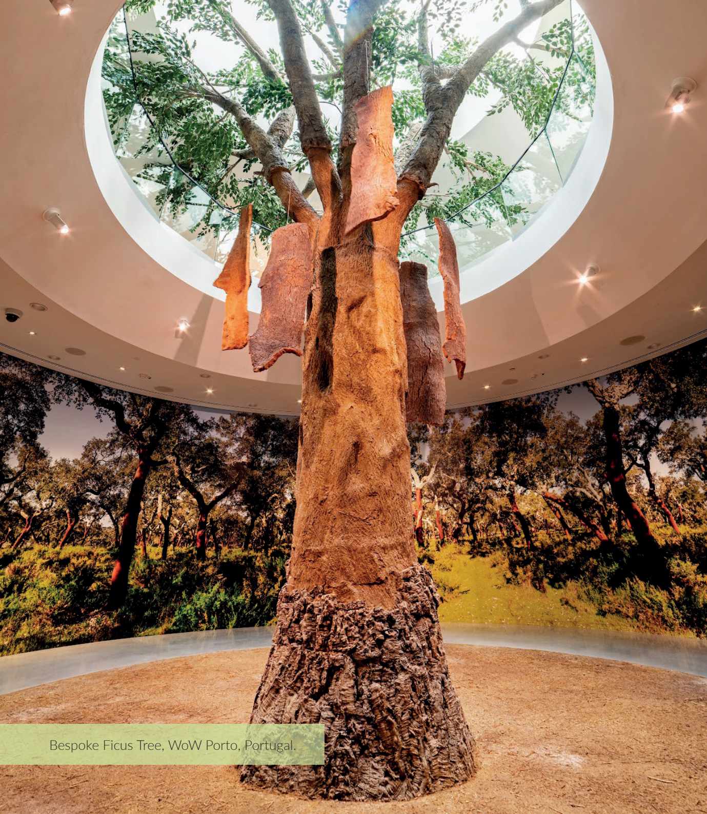
Bespoke Ficus Tree, WoW Porto, Portugal.