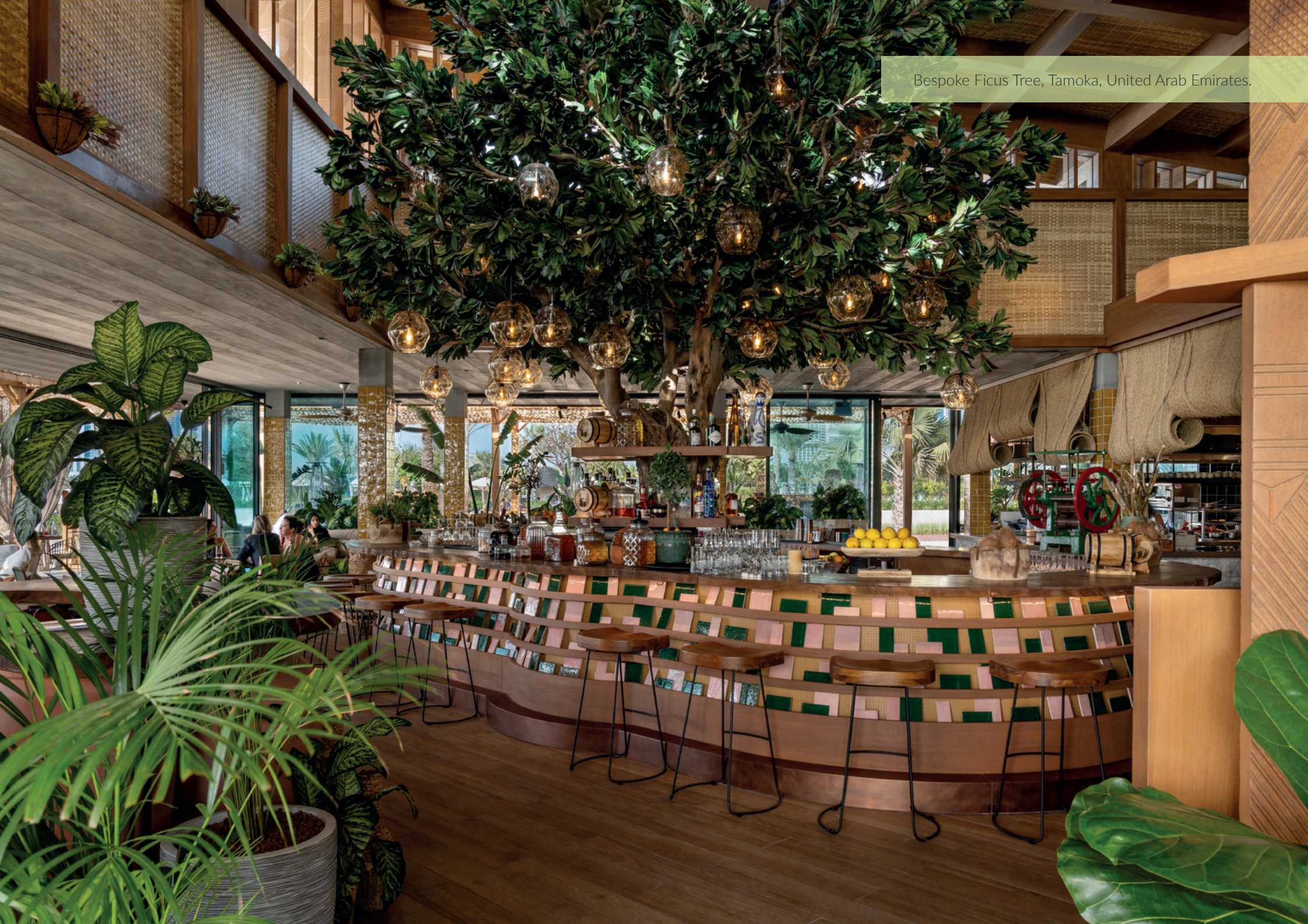
Bespoke Ficus Tree, Tamoka, United Arab Emirates.