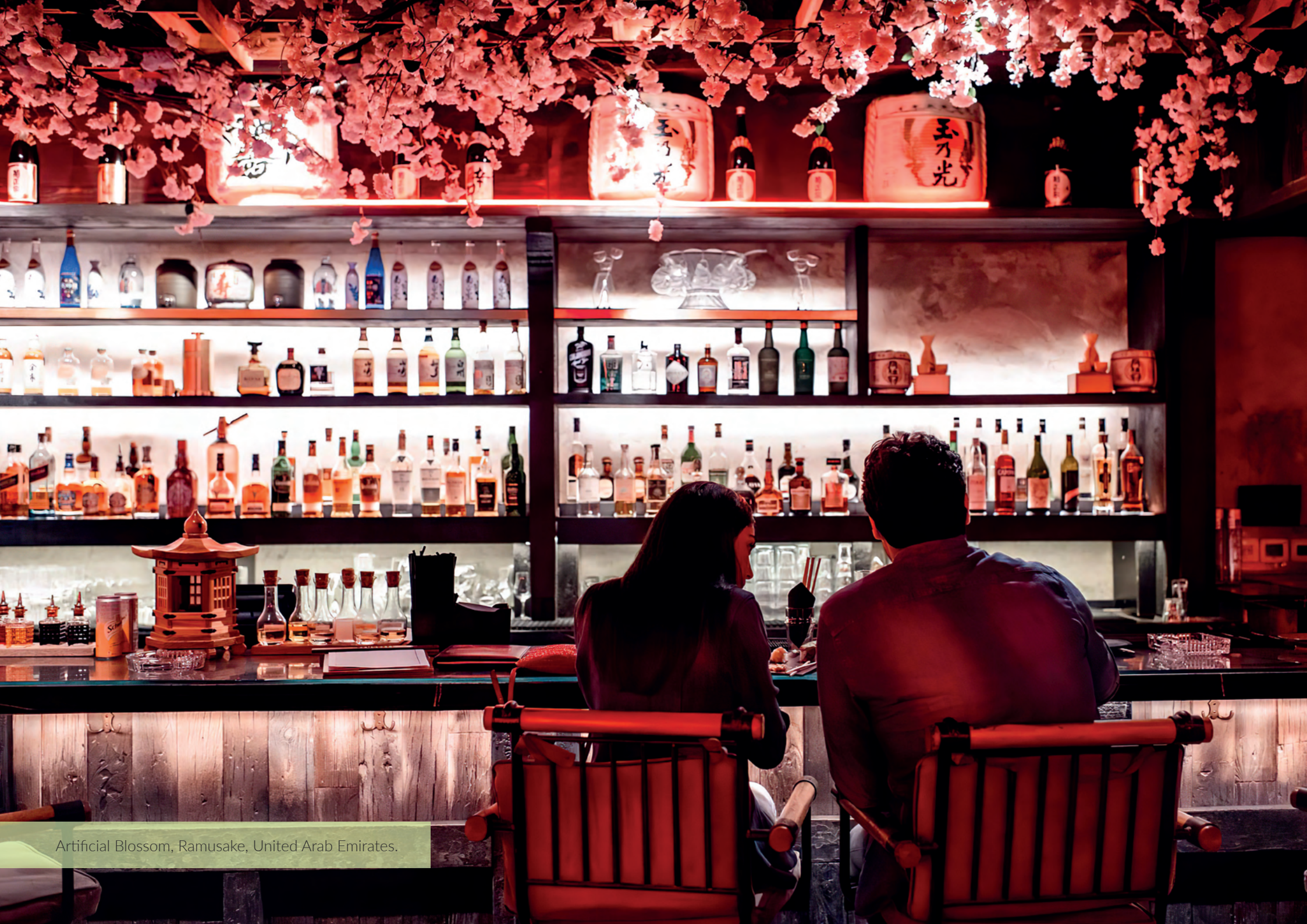
Artificial Blossom, Ramusake, United Arab Emirates.