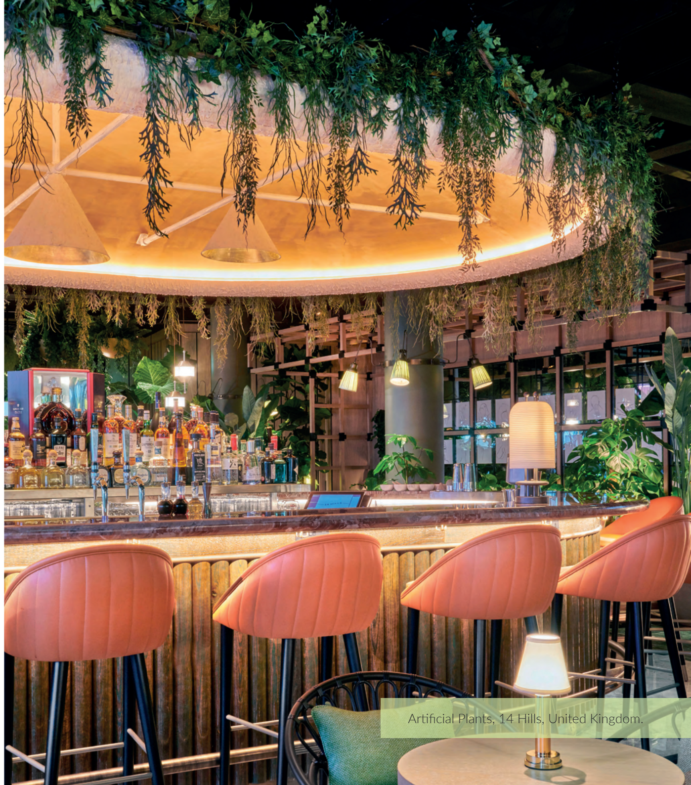
Artificial Plants, 14 Hills, United Kingdom.

In commercial settings prioritising safety, our FireSilx fire-retardant foliage guarantees both a striking appearance and peace of mind for guests, customers, and staff. Furthermore, for outdoor settings, our colourfast UVSilx foliage remains vibrant for years to come, ensuring enduring visual appeal.